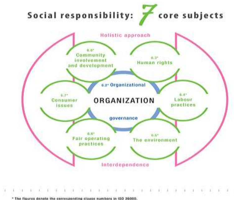
Figure 1: CSR issues in ISO26000.

CSR is a complex and ambiguous concept with no single conceptualization. However, the main topics of CSR as defined in ISO26000 include the following.